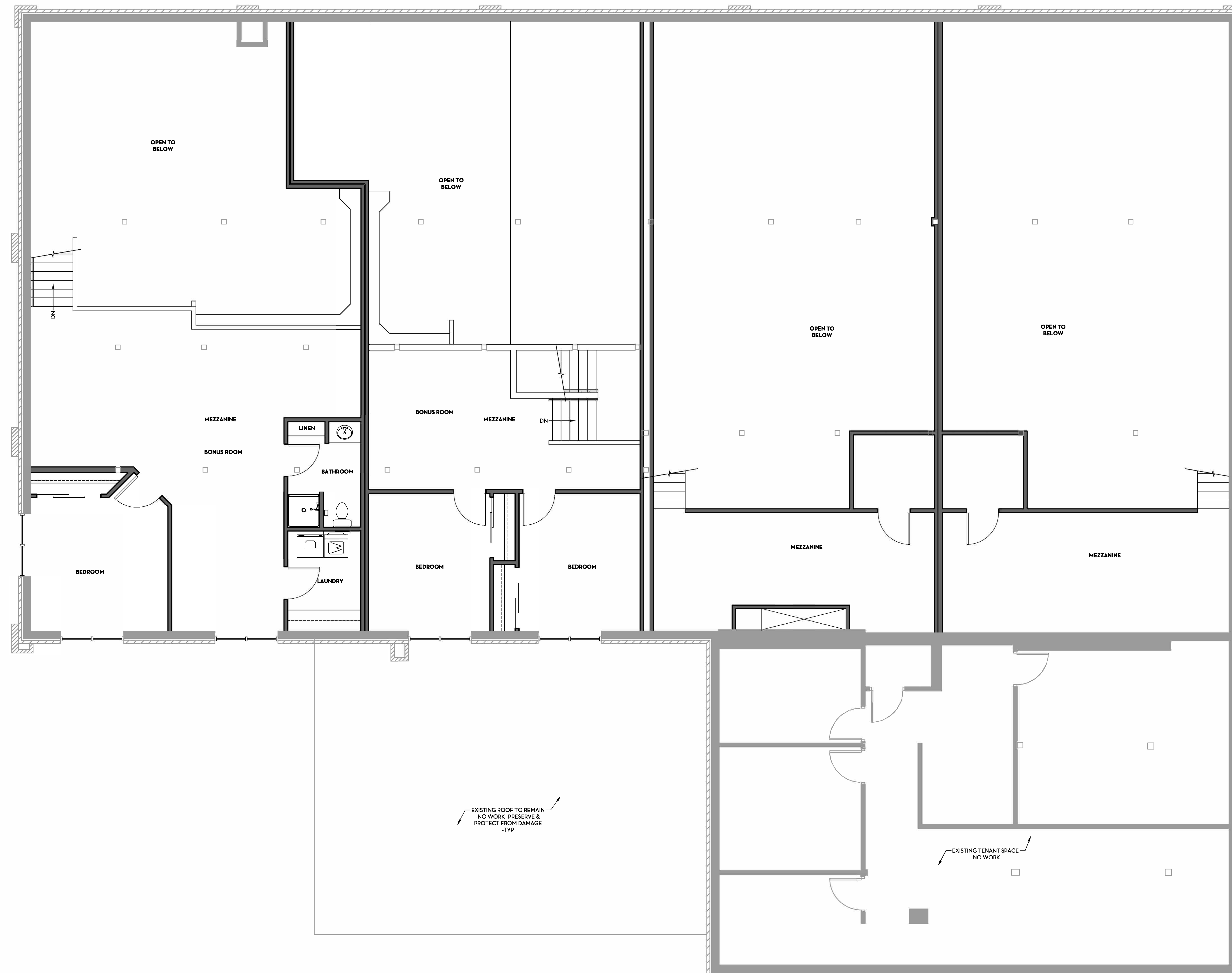
1 MEZZANINE LEVEL UNIT FLOOR PLAN SCALE: 1/4" = 1'-0"

BUILDING RENOVATION 796 11TH STREET MARION, IOWA ARCHITECTURAL MEZZANINE LEVEL UNIT FLOOR PLAN