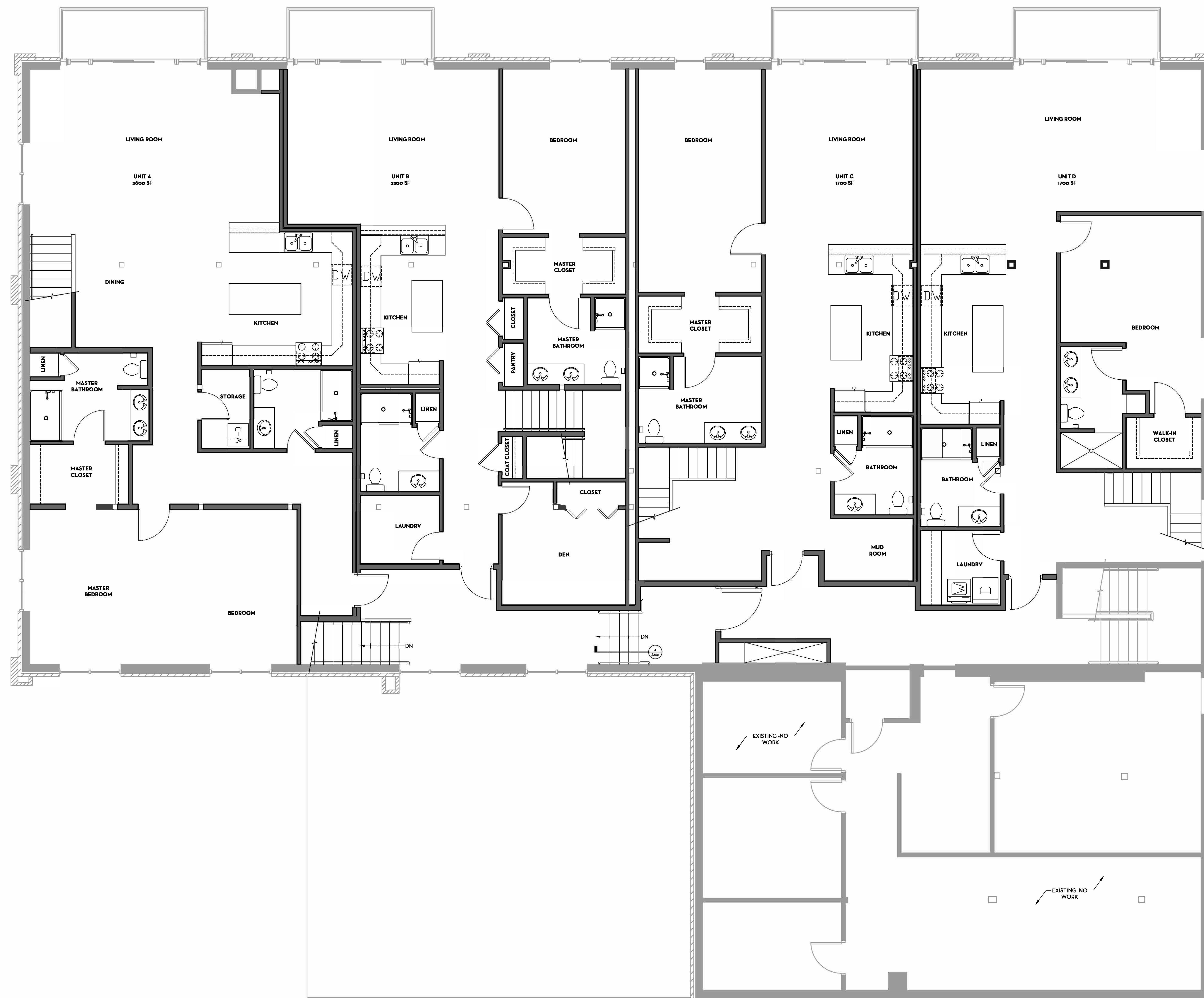
1 SECOND LEVEL UNIT FLOOR PLAN SCALE: 1/4" = 1'-0"

BUILDING RENOVATION 796 11TH STREET MARION, IOWA ARCHITECTURAL SECOND LEVEL UNIT FLOOR PLAN